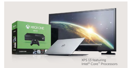
XPS 13 featuring Intel® Core™ Processors

Buy a PC $699.99+ and get a $200 Dell Promo eGift Card for use towards a TV or thousands of items on Dell.com